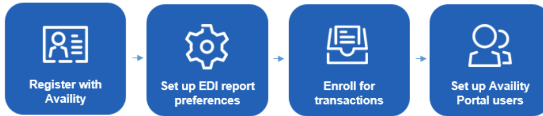
Figure 2: Setup tasks for submitting files through Availity Portal

Note: To complete the post-registration setup steps, you'll need an Availity Portal account. If you don't have an Availity Portal account, contact the Availity administrator for your business and ask them to create one for you.